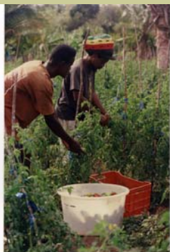
PRINCIPLE 6: Use Economic Instruments for Sustainable Environmental Management